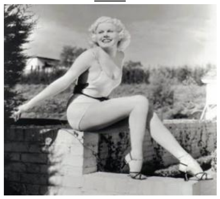
Figure 4: Jean Harlow, 1934, <a href="http://www.glamoursplash.com/2008/12/jean-harlow-june-and-marilyn-too.html">http://www.glamoursplash.com/2008/12/jean-harlow-june-and-marilyn-too.html</a>

In the 1950s, the body type promoted mainly through the film industry/ Hollywood as well as the fashion industry included large breasts, a thin waist and thin legs. The most characteristic ideal of beauty at the time was Marilyn Monroe. Throughout the decade, various steps are taken towards a thinner standard of beauty. Grace Kelly and Audrey Hepburn were thin, having an air of sophistication and refinement. At the same time, thin bodies became associated with and were considered a characteristic of the higher social classes.