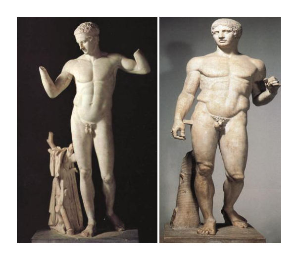
Figure 2: From left to right: Doryphoros (Canon); roman copy of Polycleitus' sculpture, 450 B.C., Naples, National Archaeological Museum. Diadumenos; roman copy of Polycleitus' sculpture, 430 b.C., Athens, National Archaeological Museum.

Although symmetry alone cannot explain the attraction of that smile, at the time the rigid concept of proportion and symmetry was prominent. Two centuries later, in the 4<sup>th</sup> century b.C., Polyclitus created a sculpture which was later named "Canon" because it embodied all the standards for the proper proportions of the body parts – yet that proportion was not the same as the past one regarding symmetry between two similar features; all parts of the