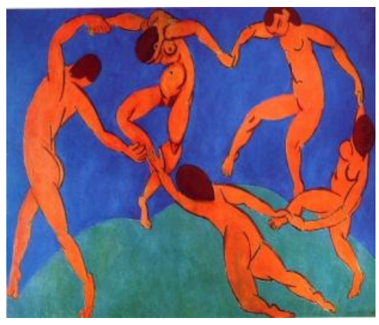
Figure 6: The Dance, Henri Matisse, 1910.

The five dancers are outlined by Matisse in thick brown lines, which accentuate simple anatomical details – the chest, the thighs, the leg muscles – in an intentionally childish way. One foot at the lower left corner of the painting is confusingly blurry, the top right dancer's stomach is clumsily defined, yet no one can seriously consider the crudeness of Matisse's design as incompetence. The left dancer's masculine image forms a perfect geometrical curve – an abstract design that, were it to be repeated, would turn into a mathematical game. Instead, Matisse does his best in tethering his ethereal imagination to the basic natural facts. One dancer is dropping his head forward, his stomach protruding, the muscles of the thighs pulling away. This raw depiction of the body releases the great visceral power of painting. It is impossible to ignore the fact that this looks like a tribal engraving or neolithic fertility idol. This form of painting reconnects contemporary vision to original art ( Jones , 2008 ).