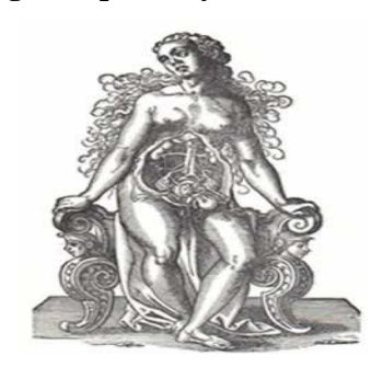
Figure 6: The grotesque body of a woman, 16<sup>th</sup> century.

Shortly before Descartes and the great "revolution" he brought upon philosophical thinking, in the late 15<sup>th</sup> century - therefore late Middle Ages -, the "grotesque" body appears: the body which eats, drinks, defecates, engages in sexual intercourse. It is a gluttonous body, whose edges spill out to the world and almost disappear. The fundamental principle of grotesque realism is degradation, deposing anything that had been raised to an intellectual level and idealized and resetting it on an earthly level. The body, the flesh, material status, instincts and urges prevail. Moreover, the grotesque looks for parts protruding from the body, parts which reach to the world and try to connect to it - a classic example: the large nose. The grotesque body is not a closed, clearly defined body, as it had been for centuries; it is a body which is open to the world, trying to connect to it, beyond any boundaries, which it essentially eliminates (Theodorou, 2013).