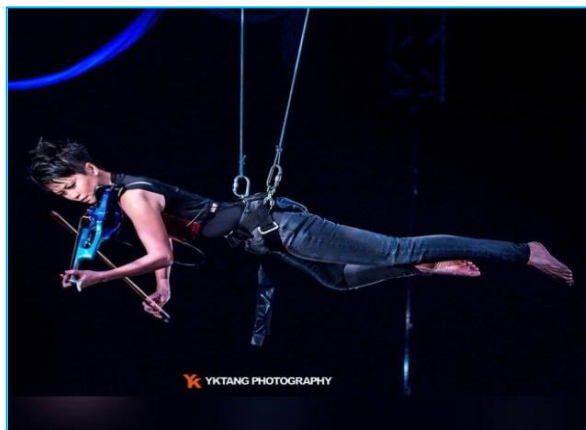
Figure 3: Photo of the event, performance of an electric violin in upside down position, taken by Yktang Photography for public promotion and used as cover photo in social media.

However, the performance style was not new (Pink did it before and it became a fashion over the years); the music was simply played back, and the mobile phone video was anything but an art work so far. A former colleague who is in the field of popular music and digital culture and was not even briefly consulted comments: 'According to my observation in Chinese Pop for years, Taiwan's Jolin Tsai (蔡依林) is the first to integrate