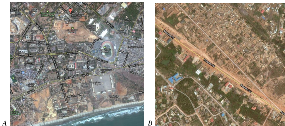
Figure 2: Maps Juxtaposition of (A) Portion of Accra City Central Core and (B) Portion of Periphery [Suburban] of Accra, Ghana

The peripheries are characterised by amorphous planning of high density residential and commercial as well as recreational and educational facilities: And, perhaps, the peripheries could be thought of as a full-fledged part of the city that reaches beyond a mono-functional zone for dwelling.