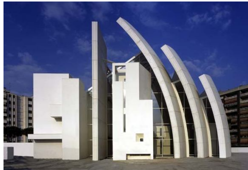
Figure 1: Richard Meier’s Roman Catholic Church at Tor Tre Teste, a suburb of the City of Rome

Powers (2010) asserts ever since then; “taste” has been invalidated as a possible rule for architectural production. This tendency results, paradoxically, from the nefarious puritan ideology of the Modern Movement, which evolved into the visually dominated manipulation of meanings proposed by the Post-Modern condition of architecture. Both Style and Post-Modern strip away from architecture any pleasure to be had in either its use or conception and the rigorous design morality imposed by the form- function polarity of the Modern Movement reduced architecture to its untouchable structural and functional bones (Powers, 2010). Many schools of thought perceive Taste as not spatially coded and discussions of taste in architecture have been gustatory. The analogy between gastronomy and architecture is not only Isidor’s fanciful etymological interpretation, but continues even today: Richard Meier’s church at Tor Tre Teste, a suburb of the city of Rome with The three shells –arcs has been described as Maltese nougat with a taste of coconut or eggshells (Figure 1) (Anon., 2010).