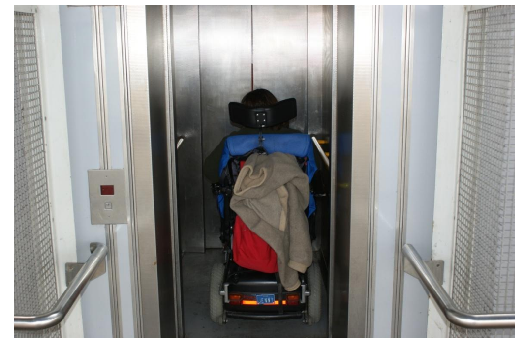
Figure 6: participant in motorised wheelchair in the lift at Greenwich DLR (control panel is to the immediate right of the participant), this participant had an assistant who travelled with them, who only just fitted in the lift at the same time.

With the Greenwich trials, due to the sample size, the time available and the difference in locations there were issues that might have been important for the software development that it was not possible to cover, including the design of the underpass at Greenwich DLR, lighting, signage, and the range of abilities and needs of potential end-users. Whilst the lift was actually accessible to all participants, it was noted that the relatively small size of the lift made it difficult for those travelling in large motorised wheelchairs with an assistant, there being little room for the assistant and limited space for turning and reaching to the controls. The fact that HADRIAN did predict some failures in task completion for participants reaching to the internal lift controls is therefore not altogether unexpected. For one platform it was necessary for the participants to reverse out as there was no space to turn the wheelchair round inside the lift (the lift to the other platform opened at the opposite side to the entry point on reaching the platform, removing this problem). Figure 6 illustrates this point with one participant in a motorised wheelchair.