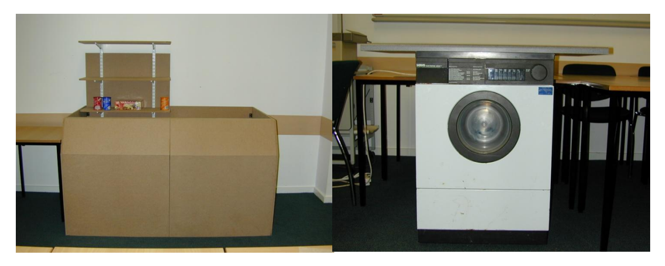
Figure 1: Chest freezer and shelving rig, and washing machine