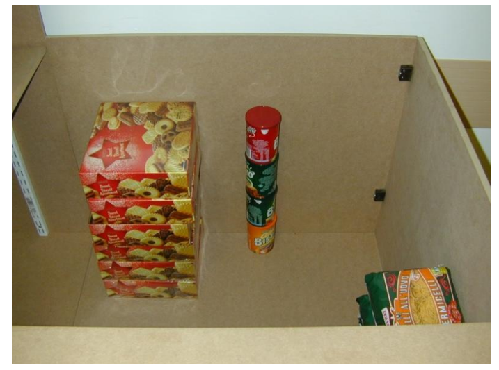
Figure 2: 1000 g and 170 g items stacked at the rear of the freezer, and 500 g items stacked at the front of the freezer

For the supermarket freezer tasks the half of the freezer rig with no shelves was stacked to capacity with items weighing 170 g, 500 g, and 1000 g (see Figure 2). Participants were given one of each item to hold prior to the trials, in order to decide if they would normally lift that weight or not. The items were positioned initially at the front of the rig, and then at the back of the rig. Participants were asked to reach to and remove all of the items that they could comfortably reach and lift, both from the front and from the back of the freezer rig. They were then asked to reach to and remove those items on the shelves on the left-hand side of the freezer rig, again only reaching to and lifting those that they could comfortably achieve. A note was made of which level for each item a participant could reach to, so that the upper and lower limits, and any weight differences in limits, could be ascertained. If a participant was unable or unwilling to lift a weight, this was noted and the next weight attempted. Video was taken throughout, and a tick-list of which weights were placed on which shelves completed.