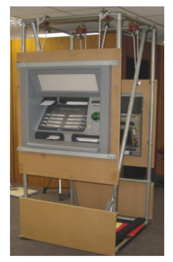
Figure 5: The ATM rig

In the laboratory trials two real ATM fascias were provided by the manufacturer and project collaborator NCR. These were attached to a specially constructed rig which allowed the height of the ATMs to be changed easily by the experimenters (Figure 5). International standards state that the recommended maximum height of the highest reachable part of the ATM (in this case the statement slot) should be between 1200mm and 1450mm, so the rig was constructed to allow both ATMs to be positioned so that the statement slot was at these two heights, and also could be positioned at intermediary heights of 1250mm, 1300mm, 1350mm and 1400mm. These ATMs were recreated in computer-aided design modelling software to the exact same specification, so that these virtual machines could be used in the HADRIAN analysis.